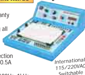
International 115/220VAC Switchable