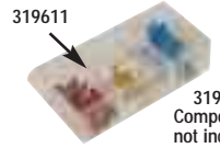
319611 Components not included