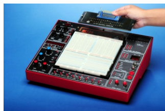
Reserve Fixed Holder It's available for various connectors.