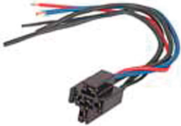
▲ Socket & Relay