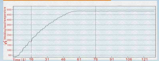
SIA Heating curve determination:

Heater fail notification: When the heater failed, "H-E" will Be shown, SIA will power off