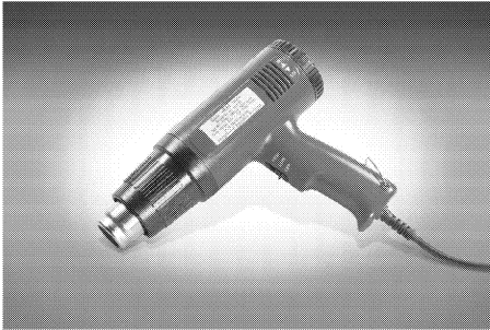
Compact, lightweight, easy to use.