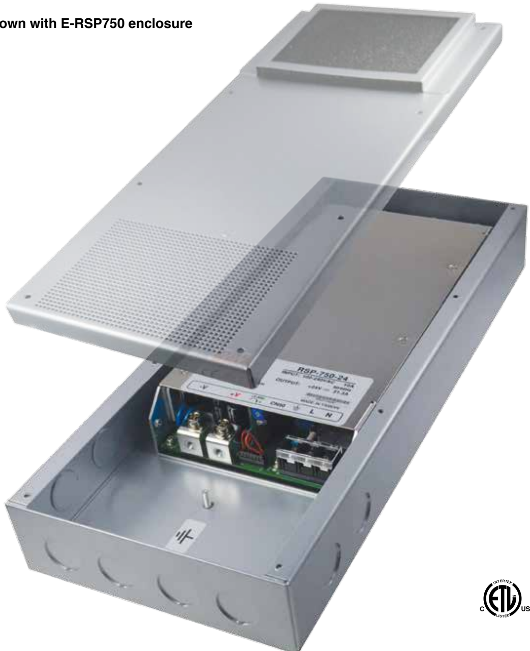
Mean Well RSP-750 shown with E-RSP750 enclosure