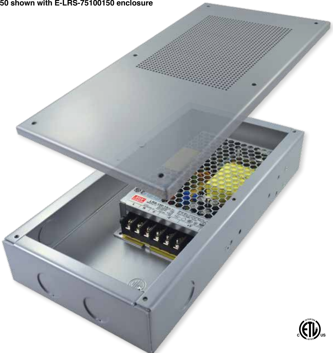
Mean Well LRS-150 shown with E-LRS-75100150 enclosure