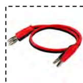
Test Leads (optional)