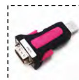
RS232 TO USB