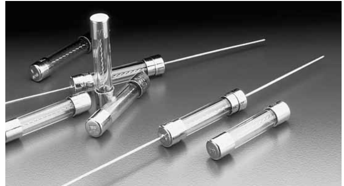
312 000 Series