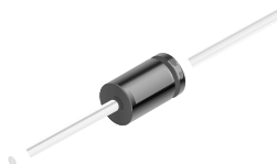
DO-41 Glass case COLOR BAND DENOTES CATHODE