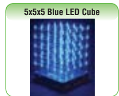
5x5x5 Blue LED Cube