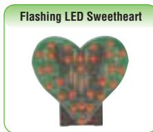
Flashing LED Sweetheart