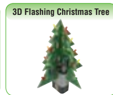
3D Flashing Christmas Tree