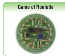
Game of Roulette